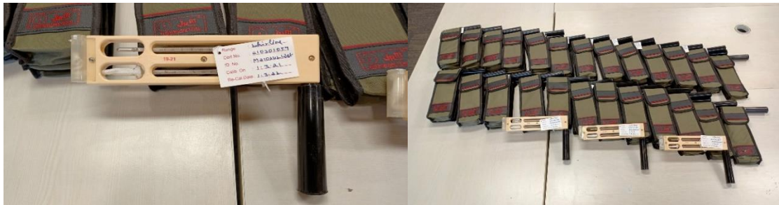
Figure 10: Reference Travelling Standard Whirling Psychrometer.