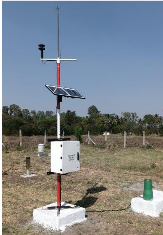
Figure 7: Reference standard AWS