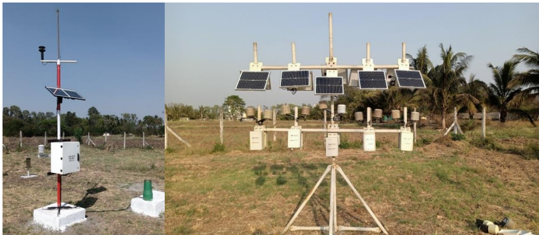
Figure 8: Sensors collocated with Reference Grade AWS for field calibration and comparison on field